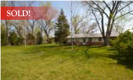
4336 63rd Street Boulder Sold for $799,700