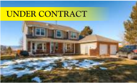
4760 Kincross Court Pinewood Heights Offered at $879,000