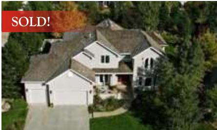
7348 Island Green Drive Gunbarrel Sold for $1,150,000