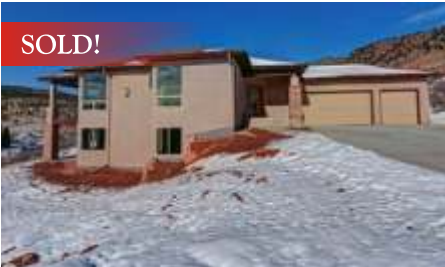
1019 Horizon Drive Lyons Sold for $791,000