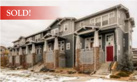
1651 Venice Lane Longmount Sold for $335,000