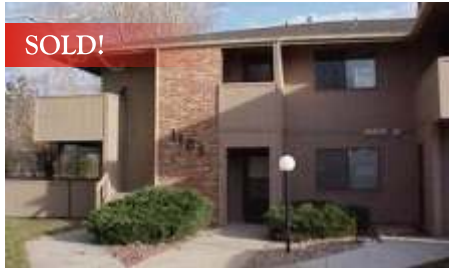
1109 Elysian Field Drive Unit F Lafayette Sold for $150,000