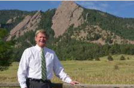
YOUR BOULDER VALLEY REAL ESTATE SPECIALIST