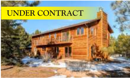
3008 S. Lakeridge Trail North Boulder/Lake of the Pines Offered at $897,000