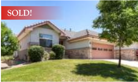
1984 Cedarwood Place Erie Sold for $390,000