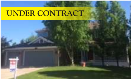
7300 Island Green Drive Gunbarrel Offered at $888,000