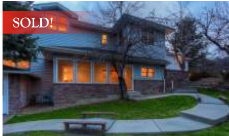
3731 19th Street Boulder Sold for $1,300,000

If you know someone thinking of selling, please call us! 303.441.5642.