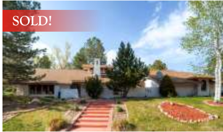
7171 Four Rivers Road Gunbarrel Sold for $640,000