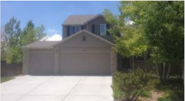
1407 Pinewood Court | Longmont 3BD, 3BA, 1,567 Sq.Ft. | $350,700