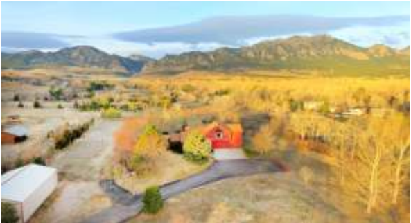
1893 Saddleback Lane | Boulder 3BD, 3BA, 3,200 Sq.Ft. | $1,875,000