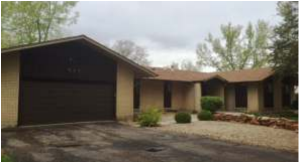
825 Rockway Place | Boulder 4BD, 3BA, 3,145 Sq.Ft. | $799,000