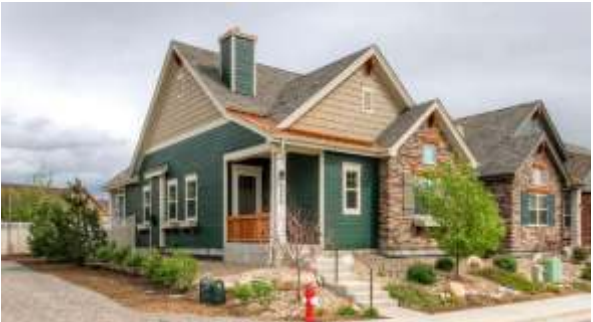
2320 W. Hecla Drive | Louisville 3BD, 3BA, 2,223 Sq.Ft. | $624,900