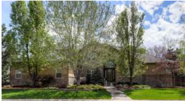
1779 Poppy Court | Lafayette 5BD, 5BA, 5,283 Sq.Ft. | $849,700