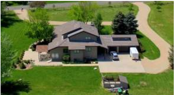
2372 Willow Creek Drive | Boulder 4BD, 3.5BA, 4,051 Sq.Ft. | $1,697,000