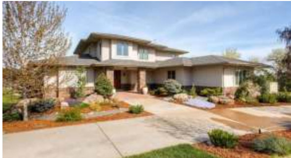
231 Ponderosa Drive | Boulder 3BD, 4BA, 2,994 Sq.Ft. | $1,495,000