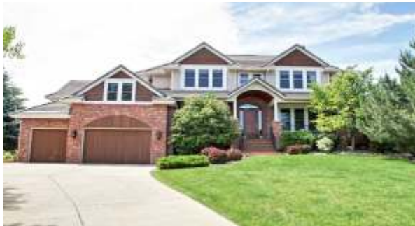
8708 Skyland Drive | Niwot 5BD+Office, 7BA, 7,757 Sq.Ft. | $1,459,000