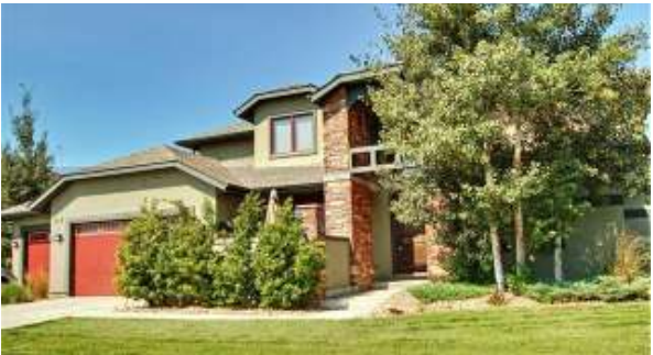
219 Meadow View Parkway | Erie 6BD, 5BA, 4,612 Sq.Ft. | $848,700