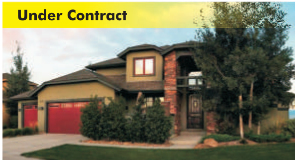
Under Contract 219 Meadow View Parkway 6BD, 5BA, 4,612 Sq.Ft. | $848,700