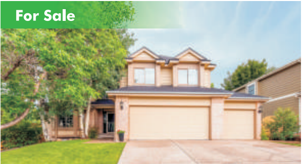
For Sale 1876 Alma Lane 5BD, 4BA, 3,276 Sq.Ft. | $698,00