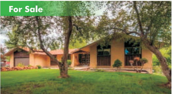
For Sale 825 Rockway Place 4BD, 3BA, 3,145 Sq.Ft. | $799,000