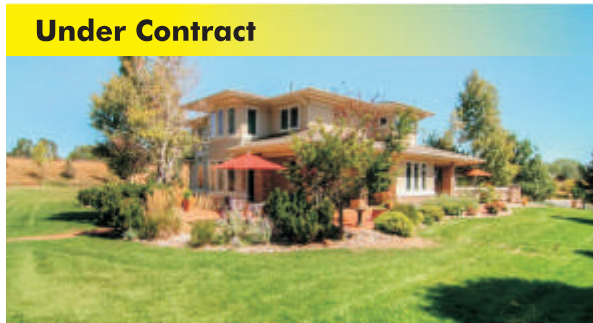
Under Contract 10443 Sunlight Drive 5BD, 36BA, 5,381 Sq.Ft. | $1,197,000