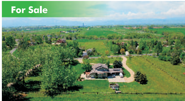
For Sale 2372 Willow Creek Drive 4BD, 4BA, 4,051 Sq.Ft. | $1,697,000