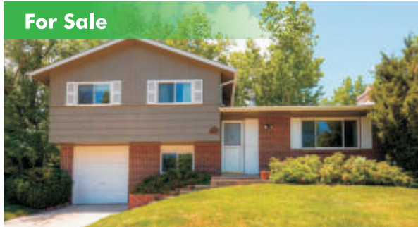
For Sale 1455 Ithaca Drive 3BD, 2BA, 1,426 Sq.Ft. | $699,700