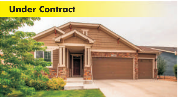
Under Contract 6309 Spring Gulch Street 2BD, 3BA, 1,886 Sq.Ft. | $350,000