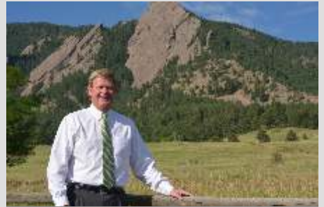
YOUR GUNBARREL REAL ESTATE SPECIALIST

If you would like your home professionally marketed and featured in my publication, which is mailed to over 1,100 potential buyers every month, call me at 303.441.5642.