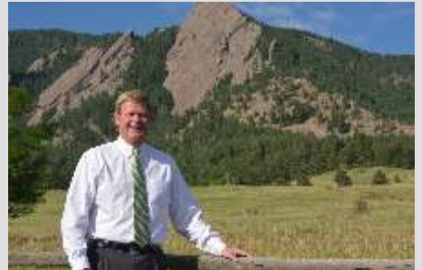
YOUR GUNBARREL REAL ESTATE SPECIALIST